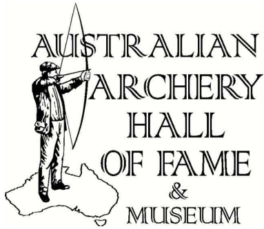
TABLE BOOKING FORM A.A.H. of F. & M. Inc. 2012 INDUCTION BANQUET For Groups of 10 or Individuals

Book a table for 10 @ $550.00 a saving of $50.00 per table